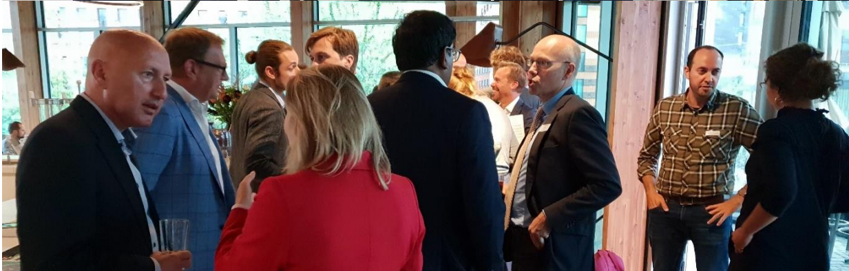
Drinks in the rooftop bar